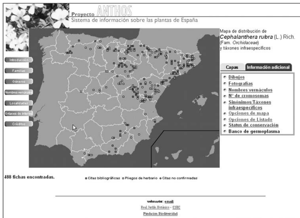
Fig. 2. Anthos output – distribution of Cephalanthera rubra (L.) Rich. in Spain, based on literature and herbarium data.

The relations between names are based on taxonomies published by the authors of the generic syntheses and the counterchecked relations in an earlier computer application (Castroviejo & al. 1996). From a single name, a consultation will therefore draw on the whole series of its synonyms. For this purpose each type of information – taxonomic, chorologic, iconographic, descriptive, etc. – has a table with the following common fields: GENERO, which includes the generic name; ESPECIE, with the name of the species; INFRANK, with the infraspecific rank (subsp., var., f., etc.) when appropriate; INFRA, with the name of the infraspecific taxon when appropriate, and AUTABRE (author string), with the abbreviated name of the authors of the taxon, whether this is specific or infraspecific.